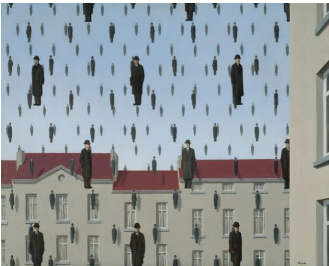
René Magritte, Golconda (Golconde) 1953. The Menil Collection, Houston, Texas