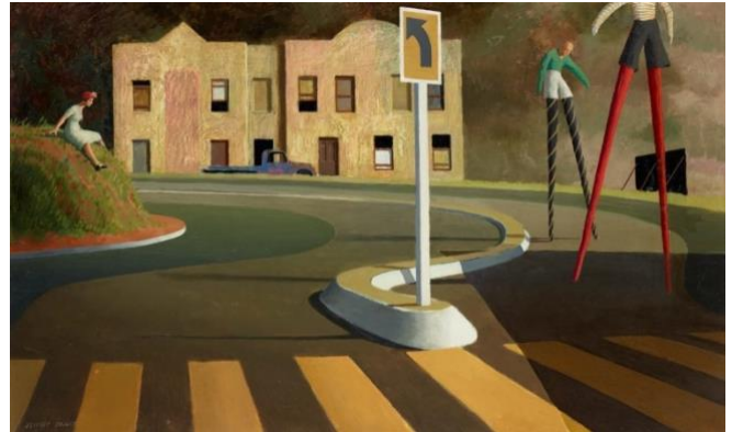
Jeffrey Smart, The stilt race , 1960, Art Gallery of New South Wales

Sidney Nolan, Ian Fairweather and Jeffrey Smart are just a few of the 50-plus Australian artists shown at the legendary Macquarie Galleries in Sydney during a glittering 25-year period between 1938 and 1963. Works from across the country have been brought together for this one-off exhibition.