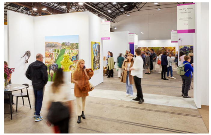
Sydney Contemporary, Carriageworks 2022