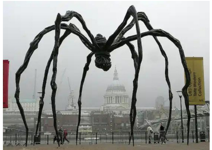
Louise Bourgeois, Maman at Tate Modern, London, 2000

Louise Bourgeois' towering bronze spider Maman , on the forecourt of the Art Gallery of NSW this summer, welcomes visitors to Louise Bourgeois: Has the Day Invaded the Night or Has the Night Invaded the Day? (25 November to 28 April). This is a landmark exhibition celebrating one of the most influential and important artists of the 20th century.