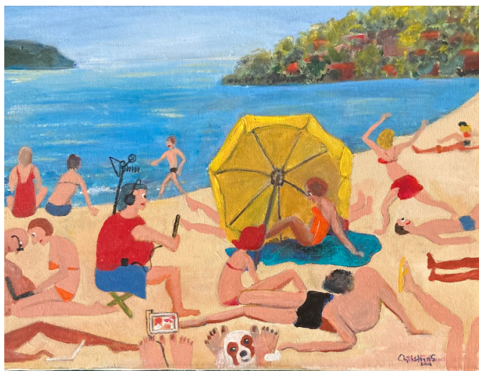
Gerald Christmas, Beach Frolics