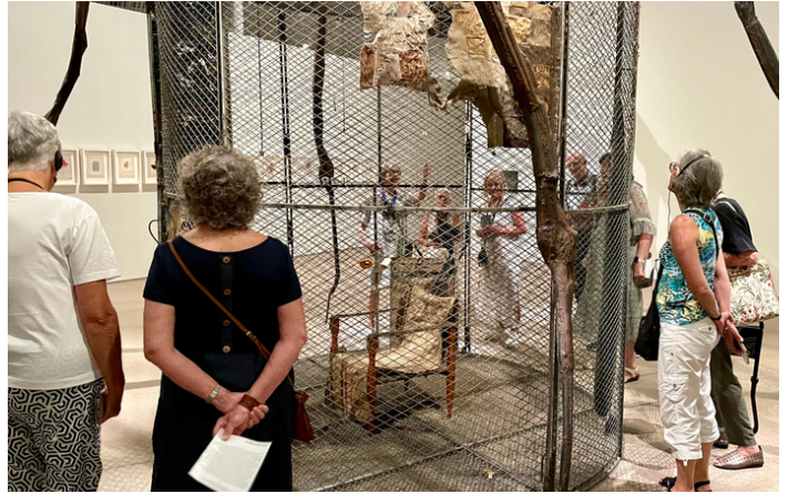
MAS tour with Louise Bourgeois' cell, 'Spider' 1997

Below: Members enjoy Second Tuesday coffee at Frenchy's