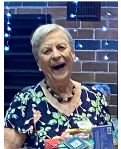
The Lucky Door Prize of a Harris Farm gift box was a huge hit